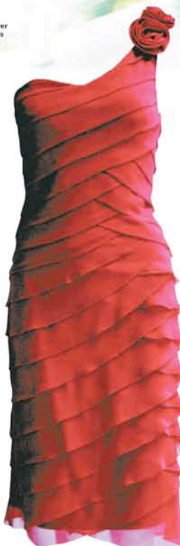
Red is romantic and daring. Cartise's Little Red Dress, $295, is all about wow factor.

nine styles, such as a flattering boy-leg brief, $30, thong, $22, push-up bra, $45, and sassy chemise in microfibre with scalloped lace, $54.