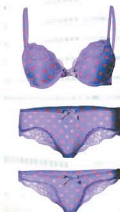
Montelle Intimates' Polka Dots Forever collection offers a splash of fun and is almost too pretty to cover up.