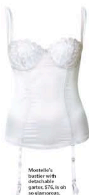
Montelle's bustier with detachable garter, $76, is oh so glamorous.

"Lingerie makes women feel sexy, giving her the added confidence to seduce her sweetheart knowing that she looks irresistible. It's the risk-and-true Valentine's Day gift that is sure to add a little passion to the night."