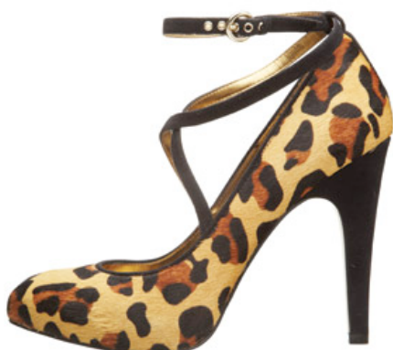
Nine West at Town Shoes. Leopard print pump, $130. townshoes.com

With fall at our doorstep, it's time to kick-start your wardrobe with the pieces that you'll reach for over and over during the season. These are the items to buy now, wear now and wear throughout the cooler months ahead for instant wardrobe update and loads of fashion mileage.