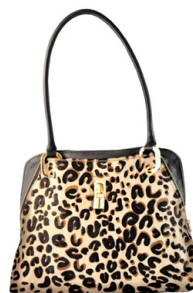
Town Shoes. Leather and pony hair handbag, $225. townshoes.com

'The Straight and Narrow' - A dominant pant silhouette this season, slim and skinny leg pants are everywhere! Available in denim and dressier fabrics, rock these pants with longer length jackets, tops or cardigans to help balance proportions.