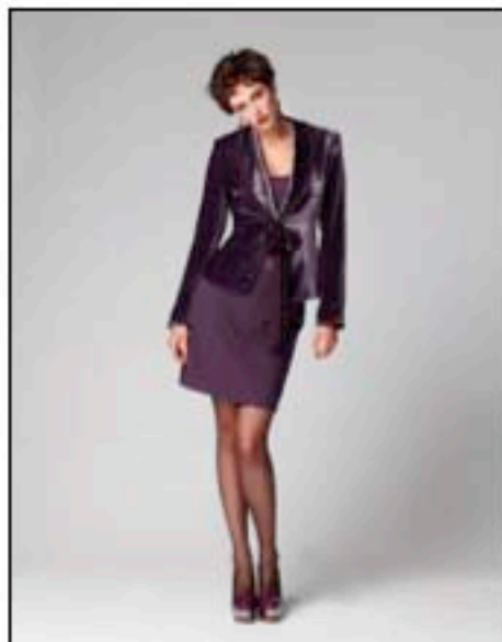
Spanner eggplant silk blend velvet jacket with chiffon bow tie closure, $279. Spanner eggplant silk blend tank with beaded strap, $129. Spanner eggplant crepe silk skirt with bow waist detail, $119. www.spannerstyle.com