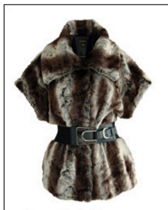
Faux fur vest by Cartise

The Great Cover-up: The ultimate option for early fall and transitional times of the year, capes and shorter length capelets offer free flowing sophisticated style. Available in a range of colours and wonderful plaids, keep your look in proportion by balancing the fullness of your cape with more streamlined silhouettes in the lower half.