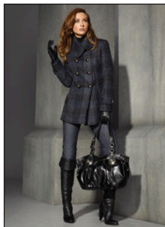
Blue plaid coat by Laura Petites

Marching Orders: Coats with a military beat take the season by storm, with updated accents including cheeky plaids, new collar details, bold button accents and more body-conscious shapes. Delivering polish and a decidedly feminine note, these coats are the perfect way to 'hup to it' come sleet or snow!