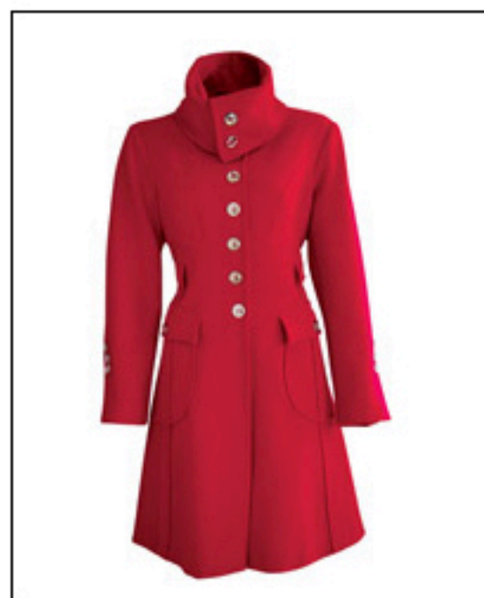
Red coat by Cartise

Get Down: Down and polyfil coats make a move uptown and get an urban aesthetic with glossy finishes, striking collar details and refined shaping through the body. Whether you're headed for Bay Street or your neighbourhood convenience store, down and polyfil coats offer tasty good looks and smart style.