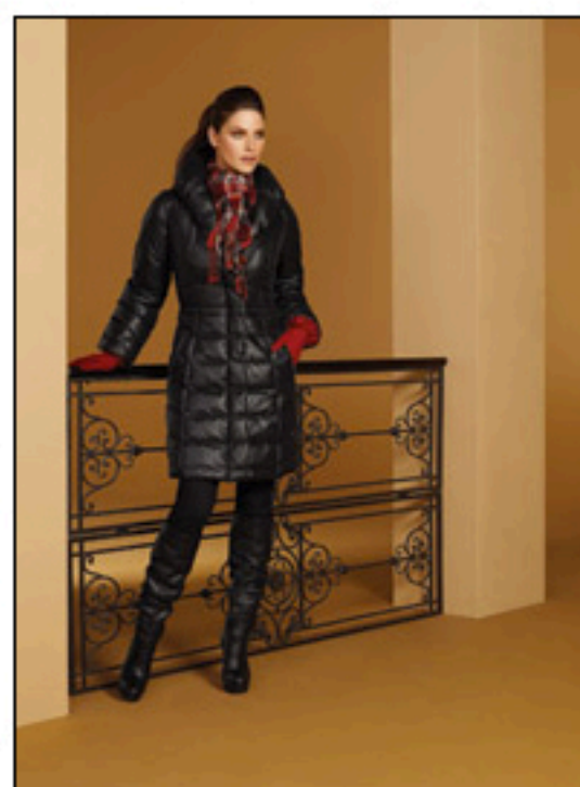
Black polyfill coat by Melanie Lyne

Creature Comforts: Faux fur is 'a flying' this season! A chic cold weather warrior, faux fur effortlessly dresses up or dresses down and is equally at home with jeans as it is with evening and office wear. This winter look for faux fur in a myriad of styles from sleek knee length