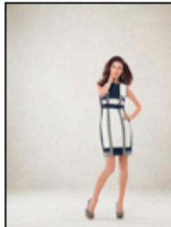
Pony, white and grey colour block dress, $195. Silver earrings, $19. Textured cuff, $25. Items available at all Melissa Lynn stores. www.melissalynn.com