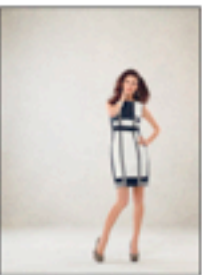
Color blocking: black and white dress with coral accents, $149. www.soomag.com