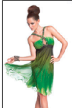
Coffee green and black colour block dress, $268. www.coffin.co